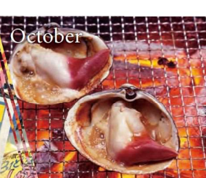
Higashi Iburi Bussan Festival