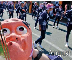
Tomakomai Port Festival (hyottoko dance)