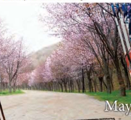
Midorigaoka Park Festival (cherry blossom viewing)