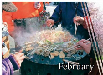
Tomakomai Skate Festival (shibareyaki barbecue)